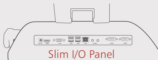
Slim I/O Panel